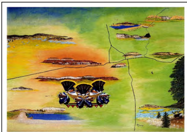
Artwork: "Ho'n A:wan Dehwa:we (Our Land)" by Ronnie Cachini, 2006

NEW EXHIBIT OPENING AND PRESENTATION: A:SHIWI A:WAN ULOHMANNE: THE ZUNI WORLD by A:shiwi A:wan Museum and Heritage Center representatives at Pueblo Grande Museum, 4619 E. Washington St., Phoenix Opening Reception 6-7 pm; Presentation 7-8 pm. Free.