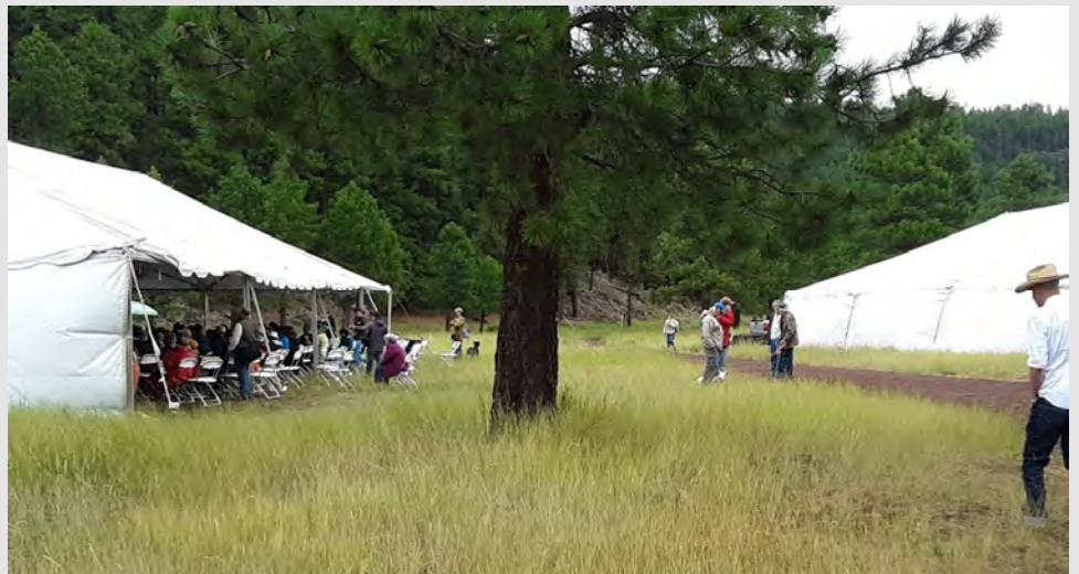
Pecos Conference August 2023 with Presentations in Progress

The Pecos Conference, open to all, has been held every year since 1927 (except 2020) in a campout location for people interested in Southwest archeology to meet and exchange information. This year it was held in the Coconino National Forest outside Flagstaff at the Hotshot Camp area. The meetings are always held in a large tent; it always rains. Presentations, with no electronics, last ten minutes each. It is a good opportunity to meet archaeologists young and old and hear about the latest research, often before it appears anywhere else. Field trips to local archaeological sites led by experts are a regular feature. About 450 people attended, including at least a dozen members of Rim Country Chapter. RCC and San Tan Chapter jointly manned a table for the AAS featuring information, documents, T-Shirts, and friendly AAS members talking about AAS.