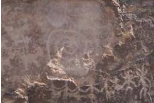
Equinox sun dagger on spiral petroglyph at Picture Rocks site, Pima County, Arizona