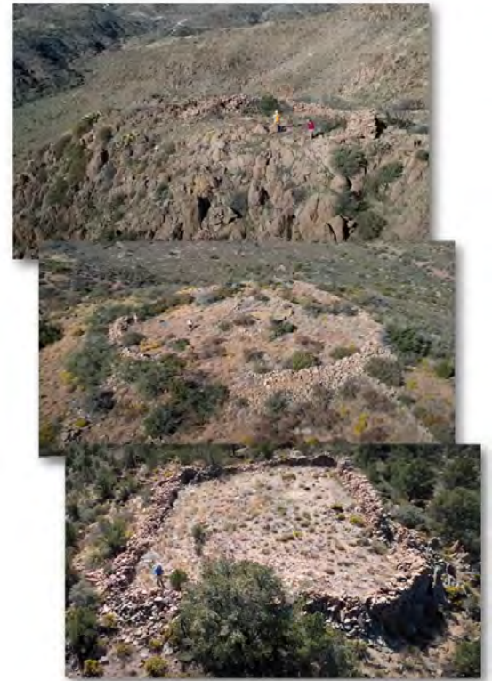
Three hilltop enclosure sites in central Arizona.

8th Tri-national Symposium: Celebrating the Sonoran Desert March 4-7, 2024