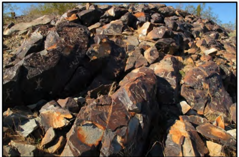
Gila River Petroglyphs