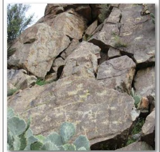
Some petroglyphs along the Badger Springs Trail

$55 donation per person ($45 for OPAC and SVM Foundation members) supports OPAC's education programs. due 10 days after reservation request or by 5 pm Feb. 7, whichever is earlier; 520-798-1201 or info@oldpueblo.org .