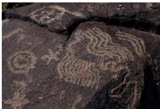
Some Agua Fria National Monument Petroglyphs to be Viewed on Field Trip