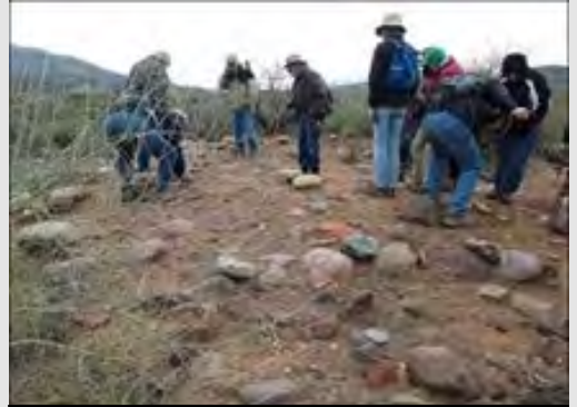
Scott Wood Explains Gisela Wall Collapse