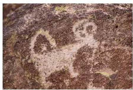
A chimera petroglyph at the Picture Rocks site