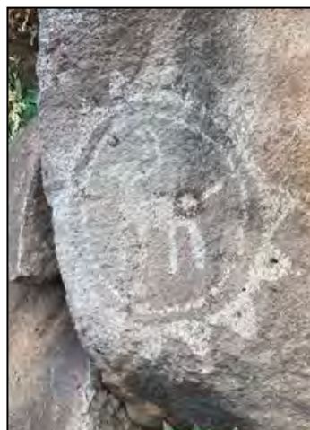
A Shield Petroglyph

March 26 San Tan Chapter Mini-Expo: The San Tan Chapter held their Mini-Expo Invitation to Arizona Archaeology on the grounds of the San Tan Historical Society Museum in Queen Creek. There were many hands-on activities related to archaeology such as flintknapping, miniature adobe brick making, pottery making and various information booths such as one on the Site Stewards program and one on historic cotton. The Pinal County Museum had their information booth along with S.A.L.T (Study of Ancient Lifeways and Technologies) teaching people arrow-straightening and fire-starting. A fun day for many in Queen Creek!