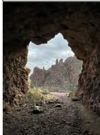
Left: View From Historic Hwy 60 Tunnel Right: Ore Wagon Wheel Ruts Worn into Stone