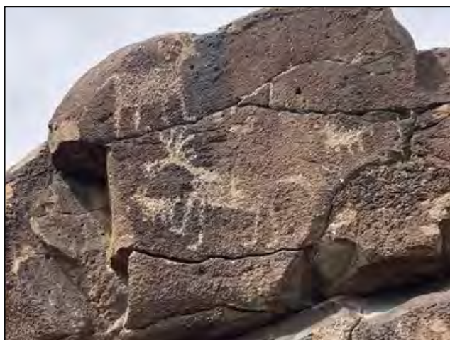
Animal Petroglyphs at Brooklyn Ruins Complex