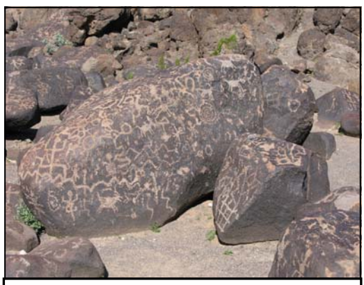
Petroglyphs at Painted Rock