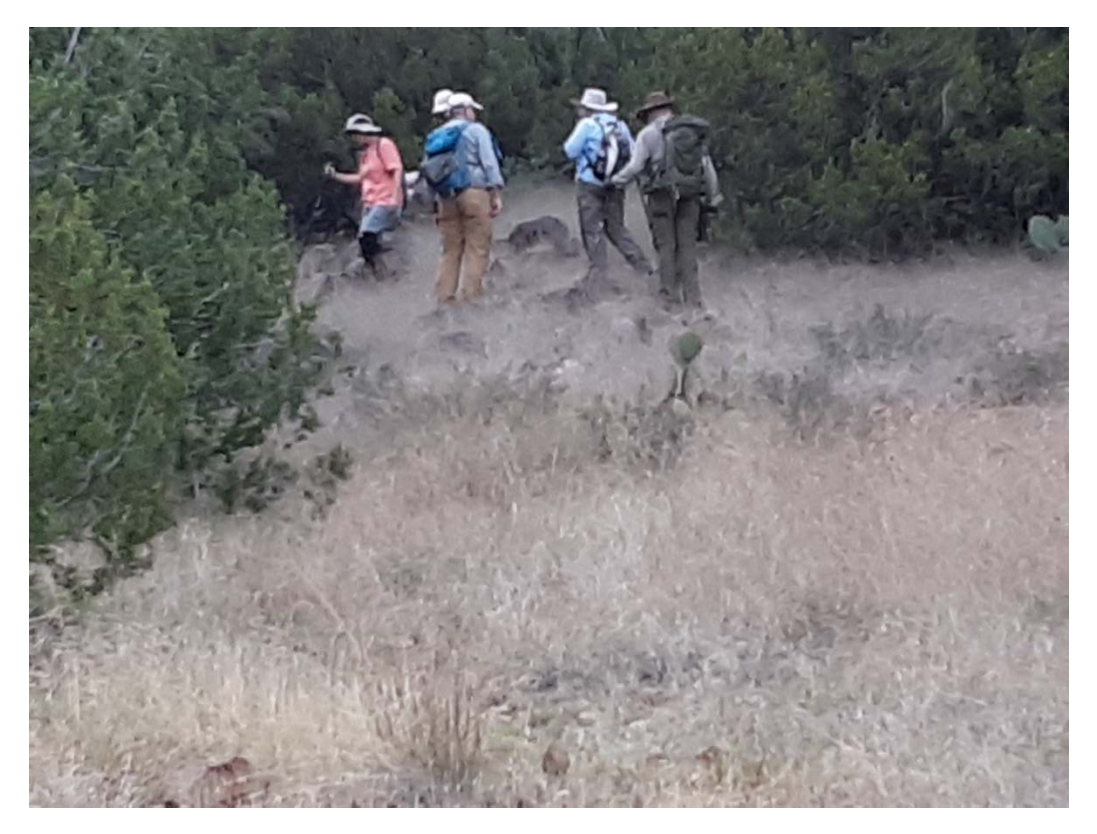
Hike Participants Beginning Departure from Vista Acres