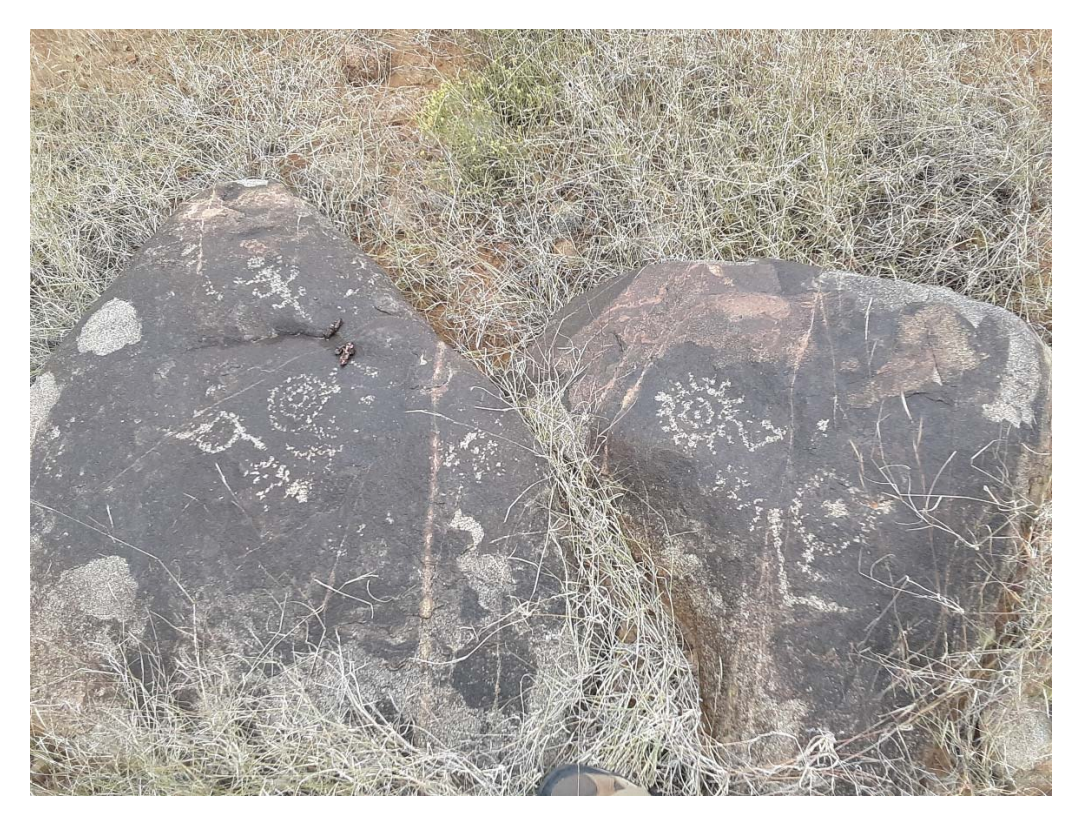
Two More Third Cluster Boulders with Petroglyphs