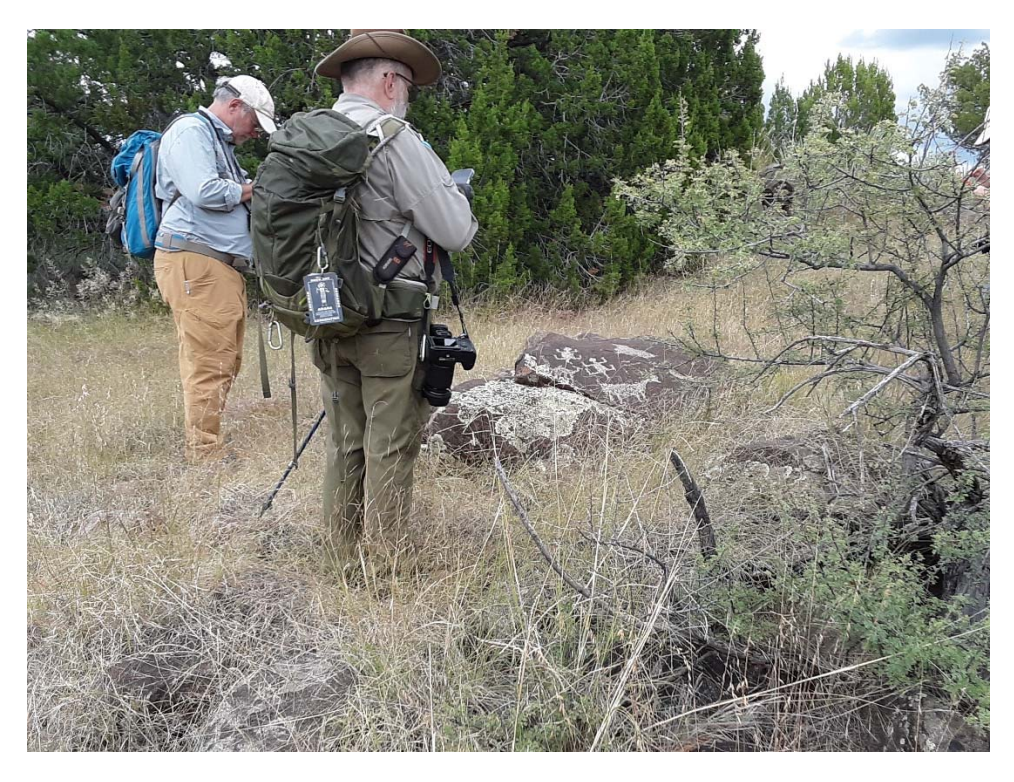
Hike Participants Photographing a Boulder in the Third Cluster