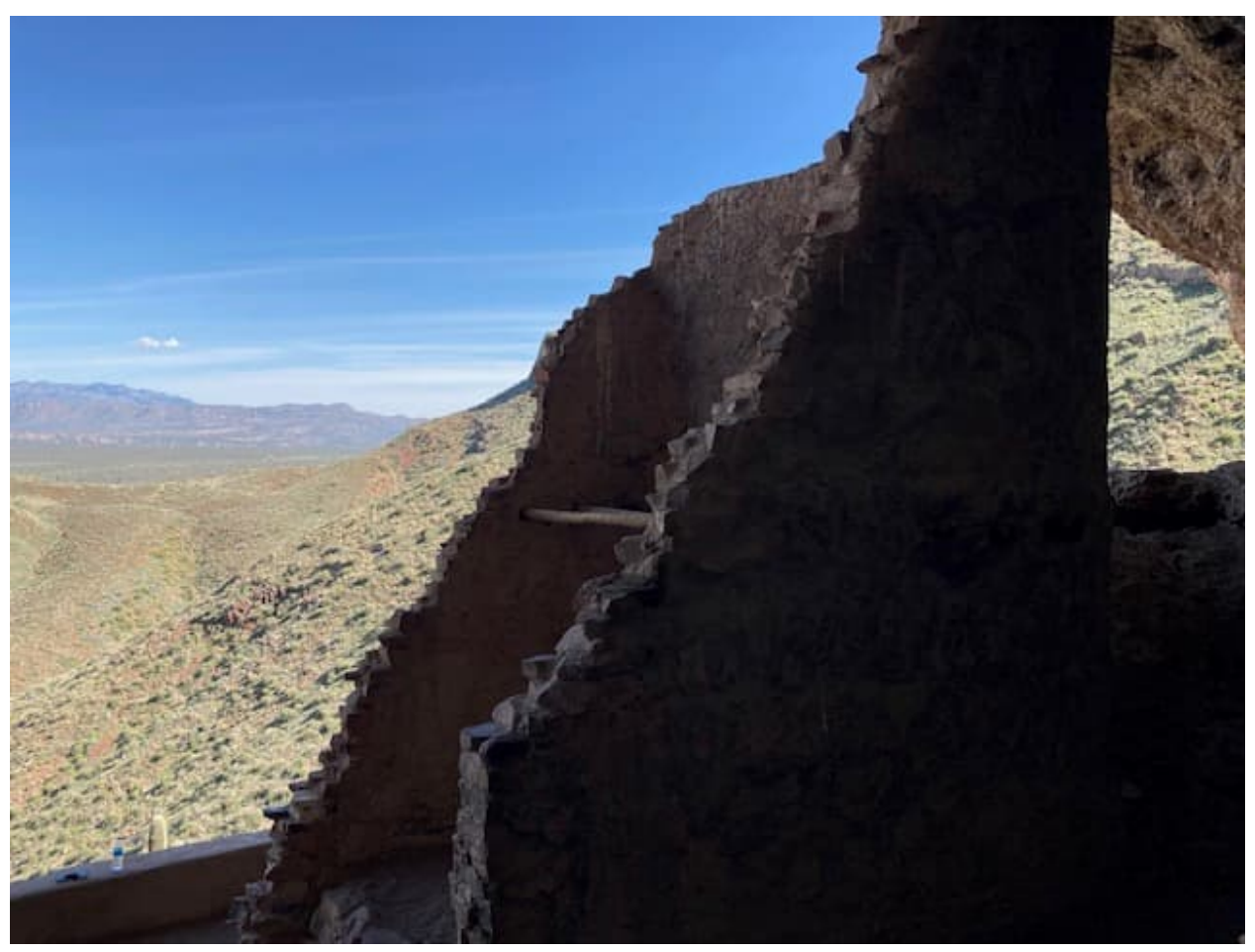
Multi-storied walls in the Lower Ruin