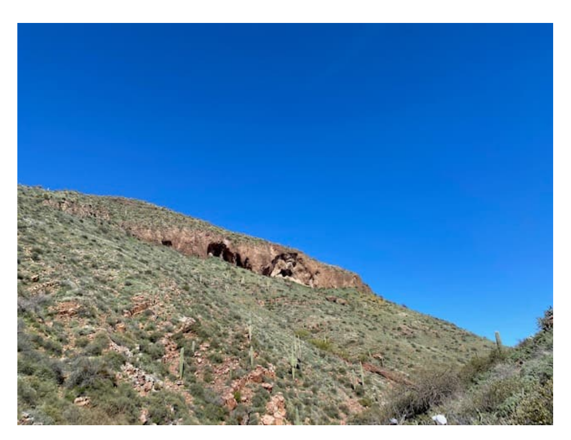
Tonto Upper Ruin, Viewed from Afar