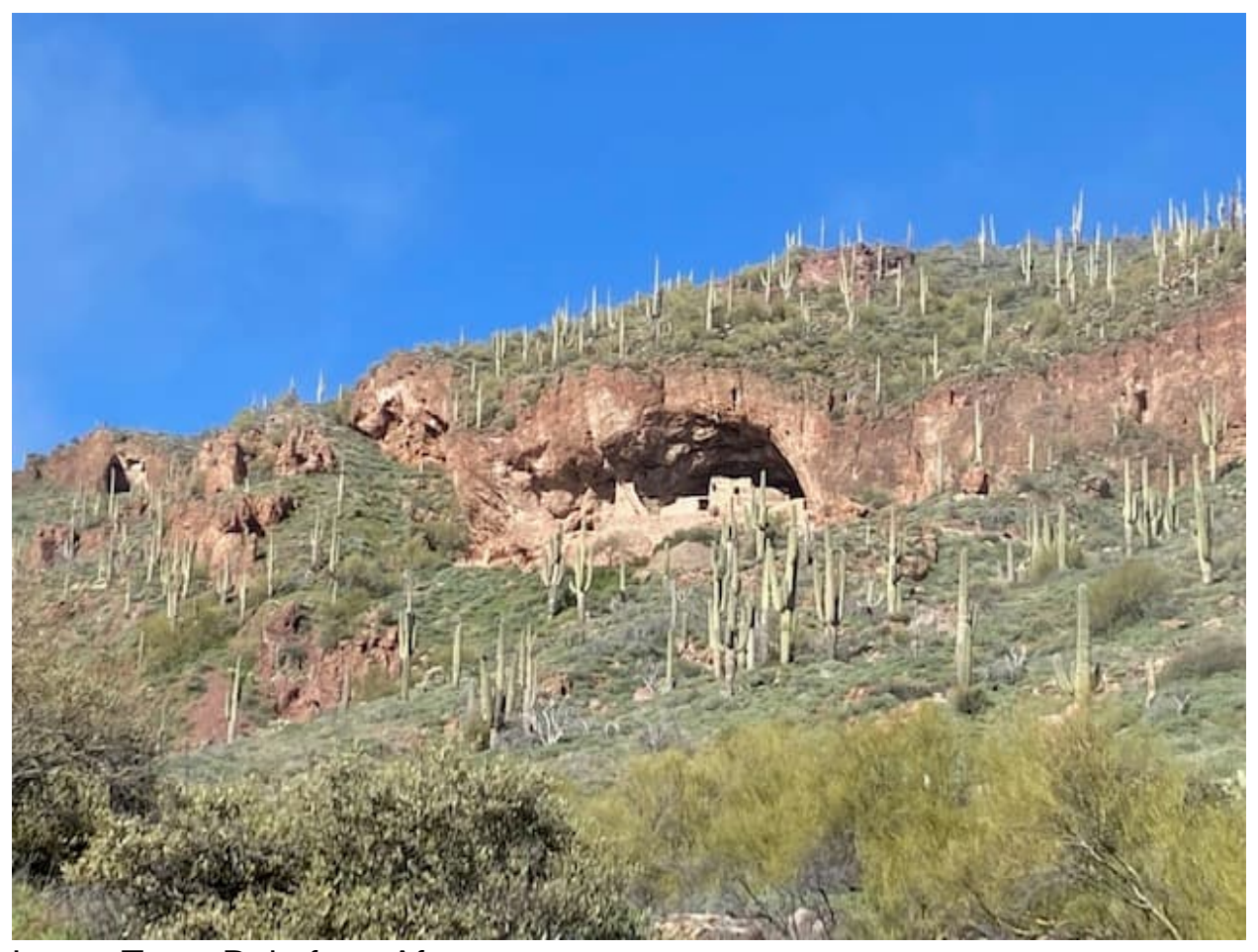
Lower Tonto Ruin from Afar