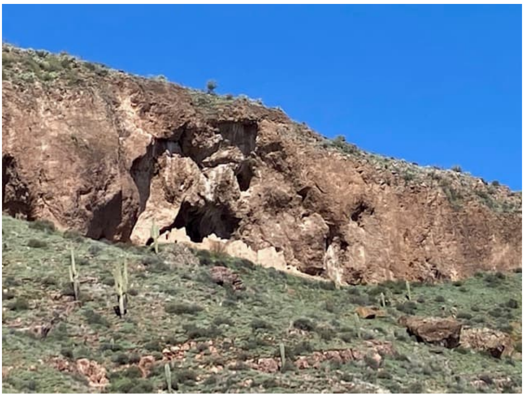
Tonto Upper Ruin, Viewed closer up