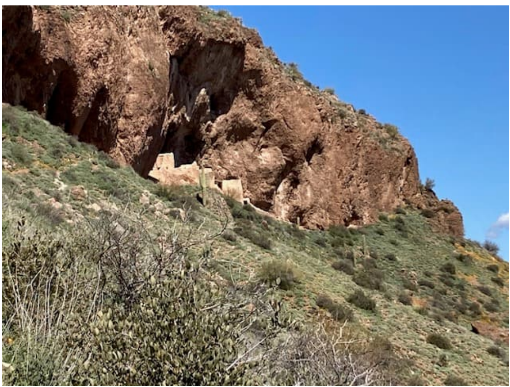
Approaching the Upper Ruin