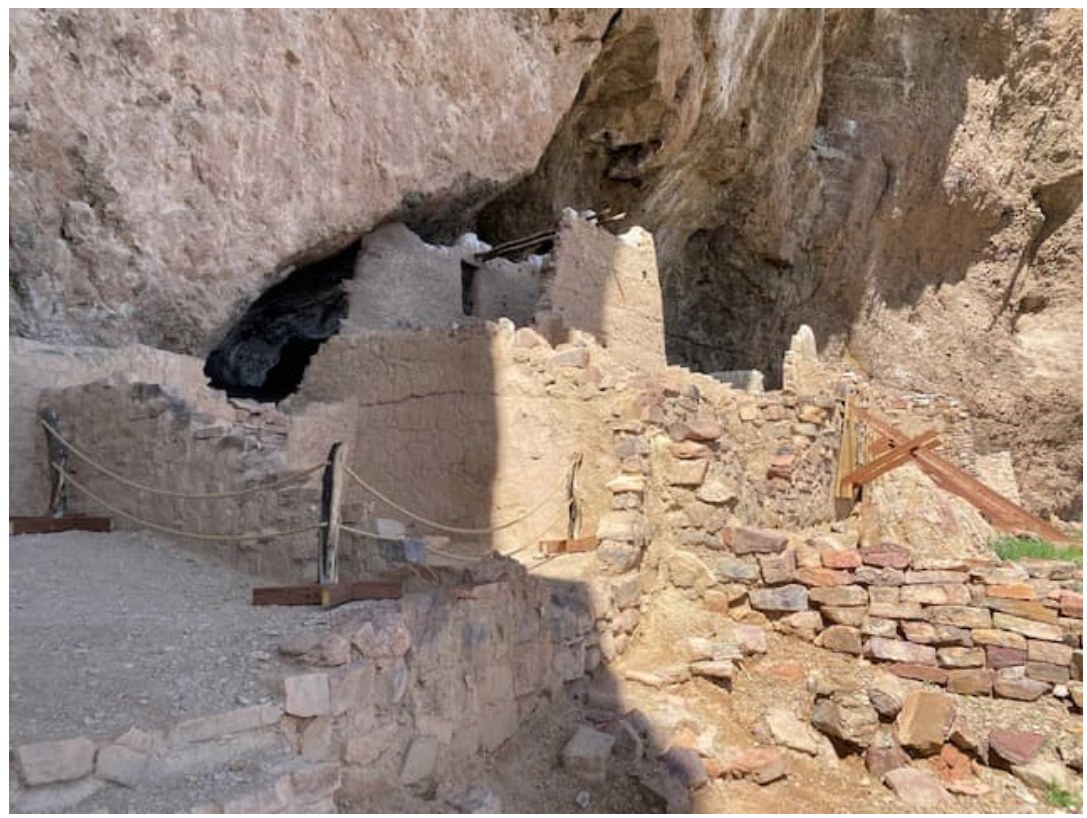
Entering Tonto Upper Ruin, Note Wooden Wall Bracing Right Center