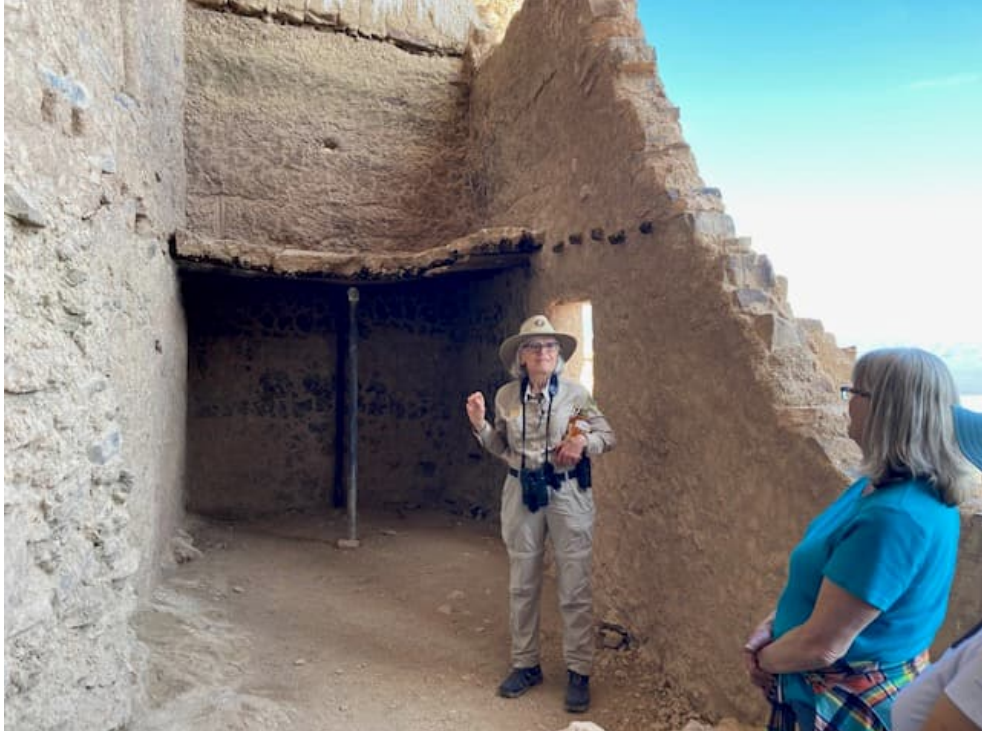
These are right above photo below ...