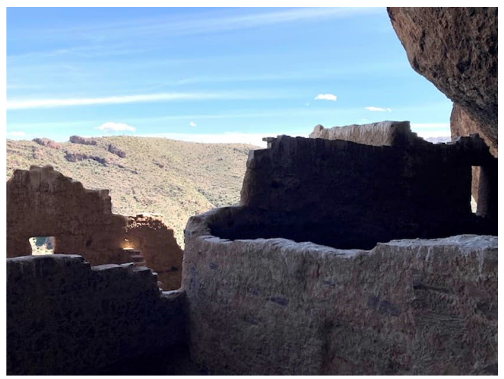
Original plaster covers most walls