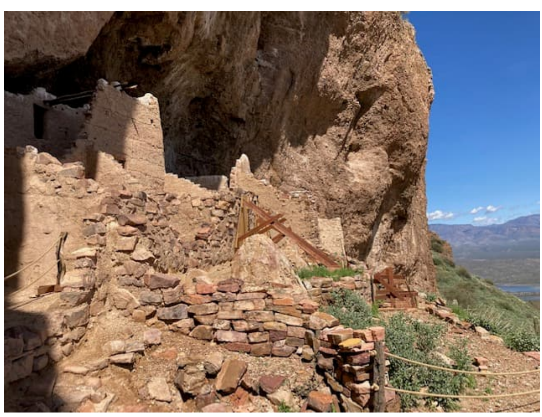
Arriving at Tonto Upper Ruin