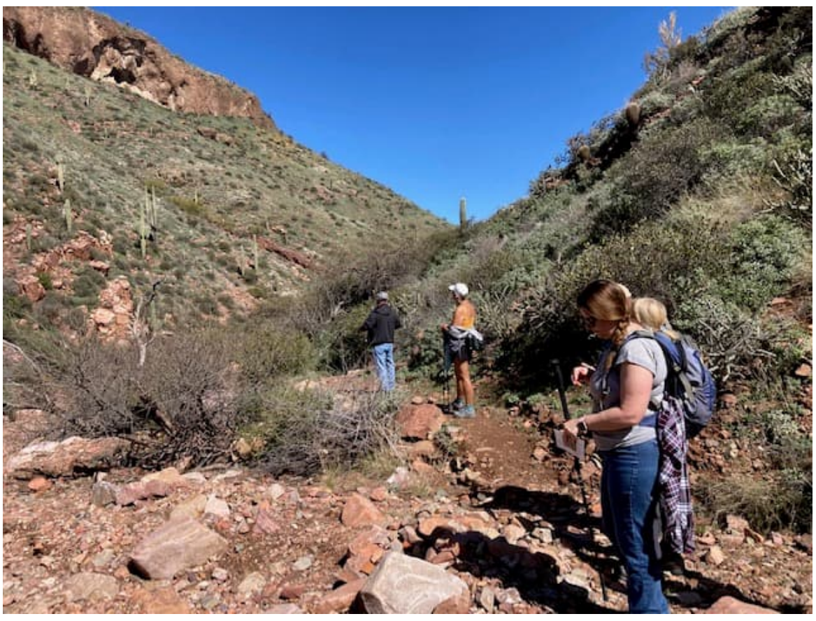
Heading up the trail