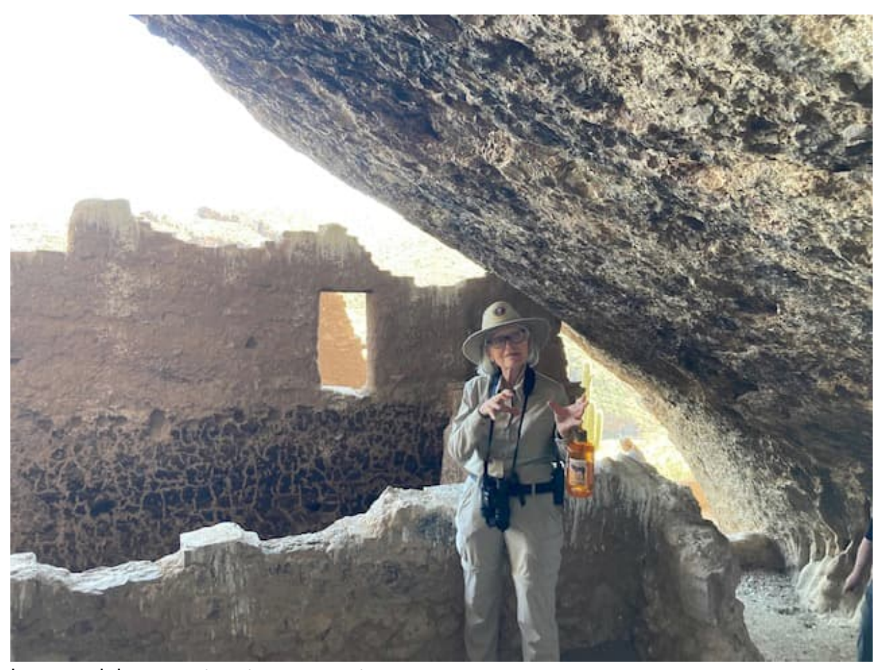
Lucy explains Photo by