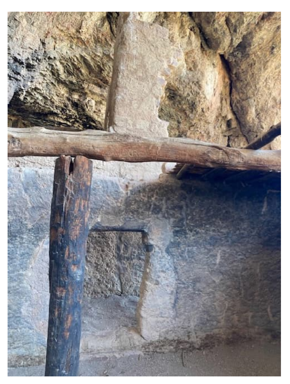
Original post & beam in the Lower Ruin