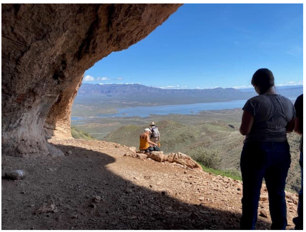
Last Rest Stop Before Entering Tonto Upper Ruin