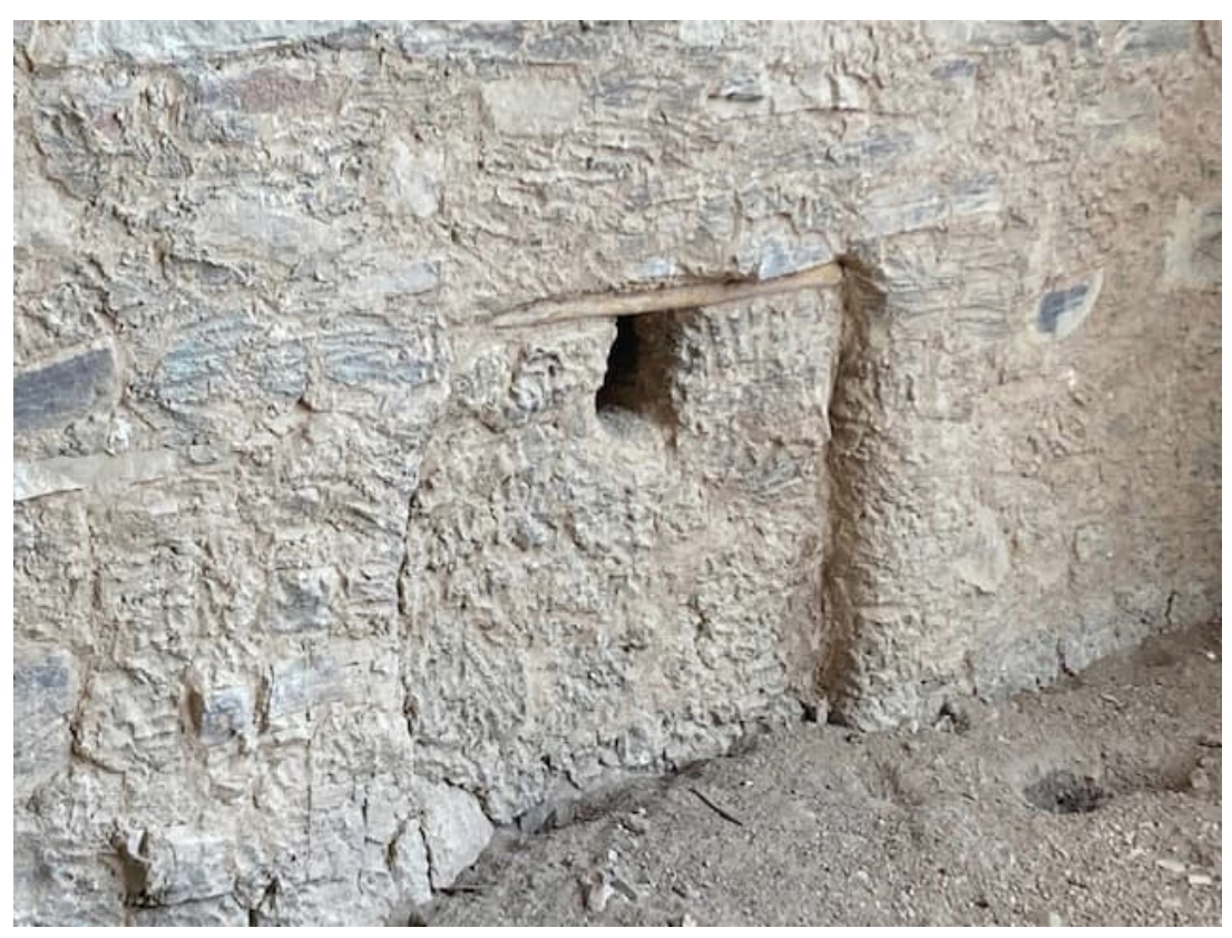
Filled-in doorway, much evidence of remodeling during prehistoric occupation