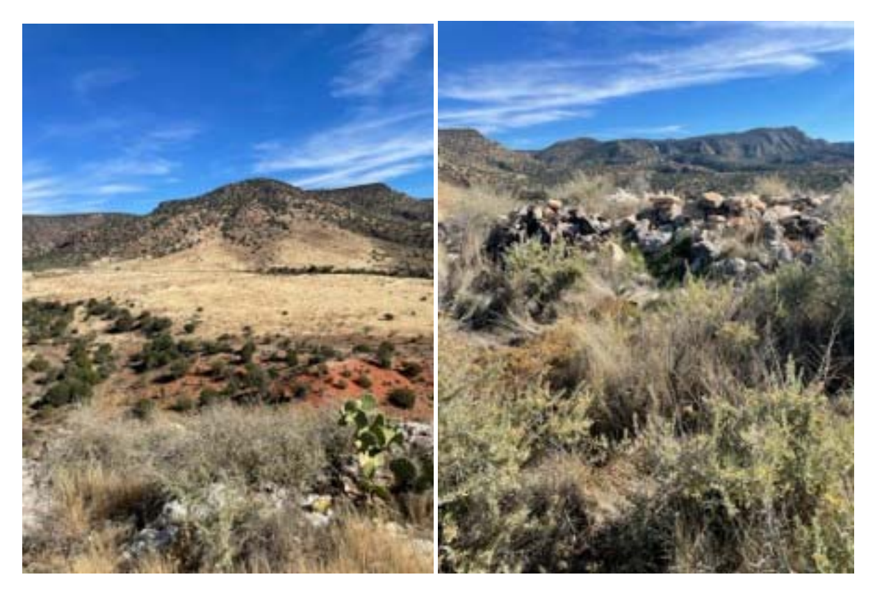
Some of the Pueblo fallen walls on Sacred Mountain, and Looking Back Up