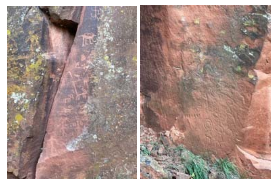
Sections of Petroglyph Panels at V-Bar-V

A Close-up view of the rock cleft through which the sun shines to place a sunlight mark on specific key petroglyph markers on the main panel as specific points in the solar cycle.