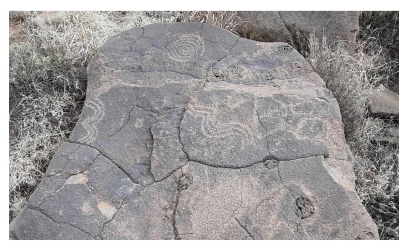
Some Petroglyph Panels Showed Similar Petroglyphs Above and Below Both have Wavy Parallel Line Figures