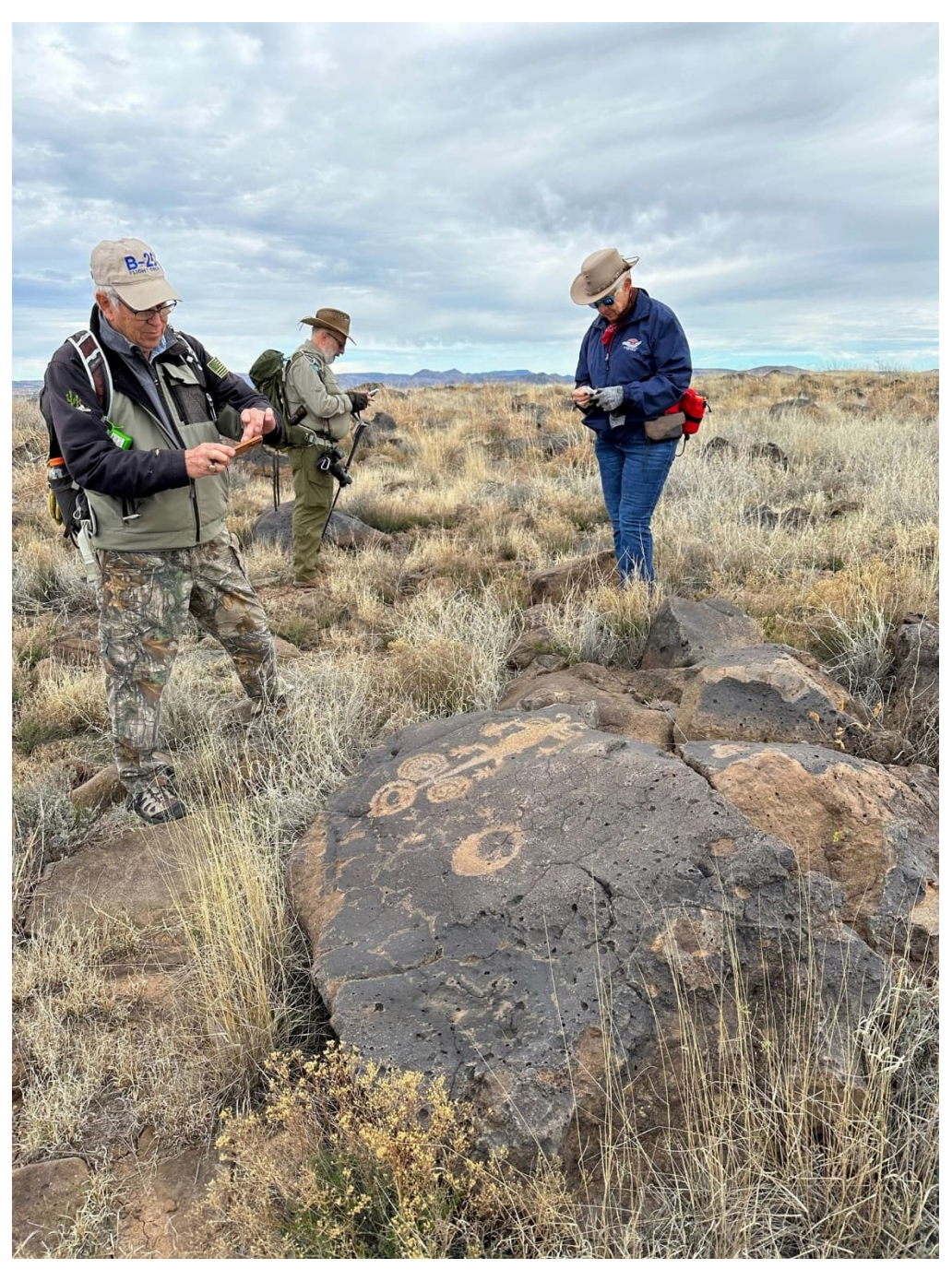
Field Trippers Photograph the "Mystic Lizard" Petroglyph