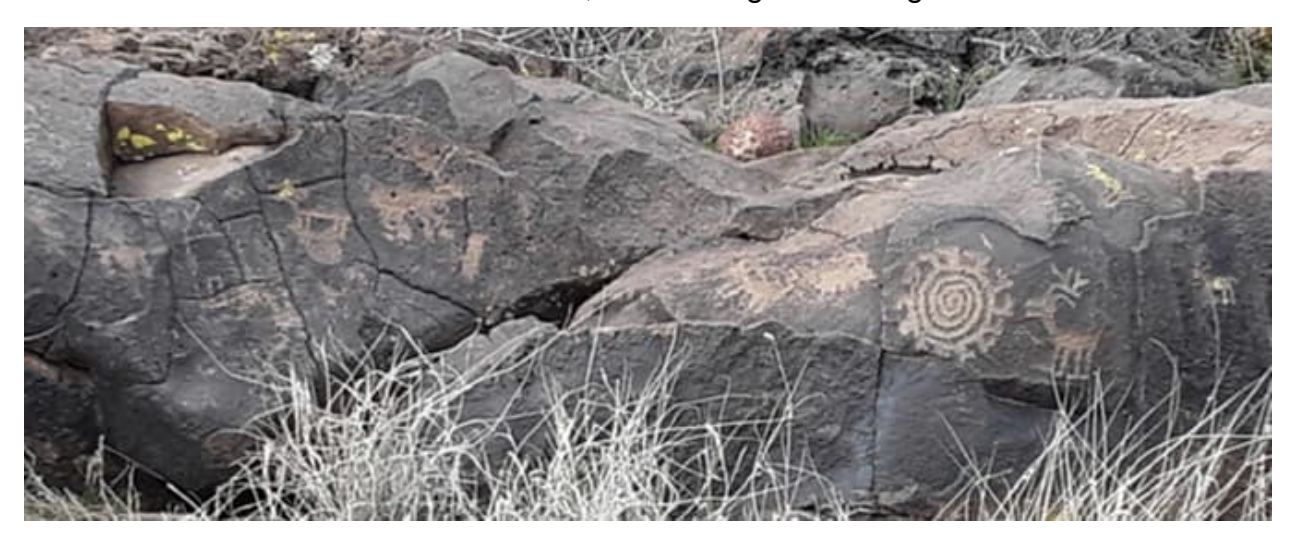
Some Petroglyphs were Intriguing and Others Were Fantastic