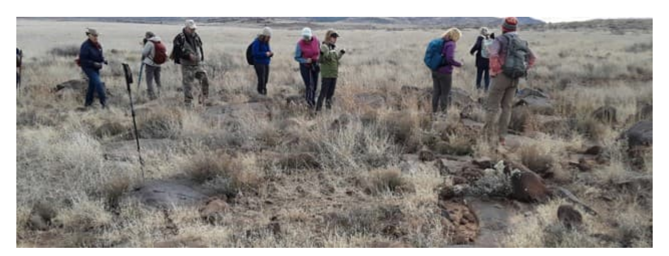
Field Trippers Searching in a Wide Field for Petroglyphs on Boulders

Field Trippers from Rim Country Chapter and several other AAS Chapters assembled at the Agua Fria National Monument off Interstate 17 arriving by self-arranged transportation. They then caravanned to the hike "trailhead" (There was none).