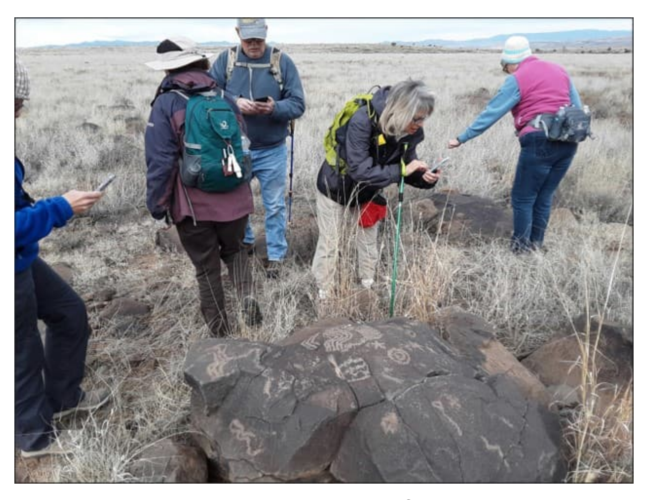
Field Trippers were Regularly Rewarded with Boulders Covered with Petroglyphs