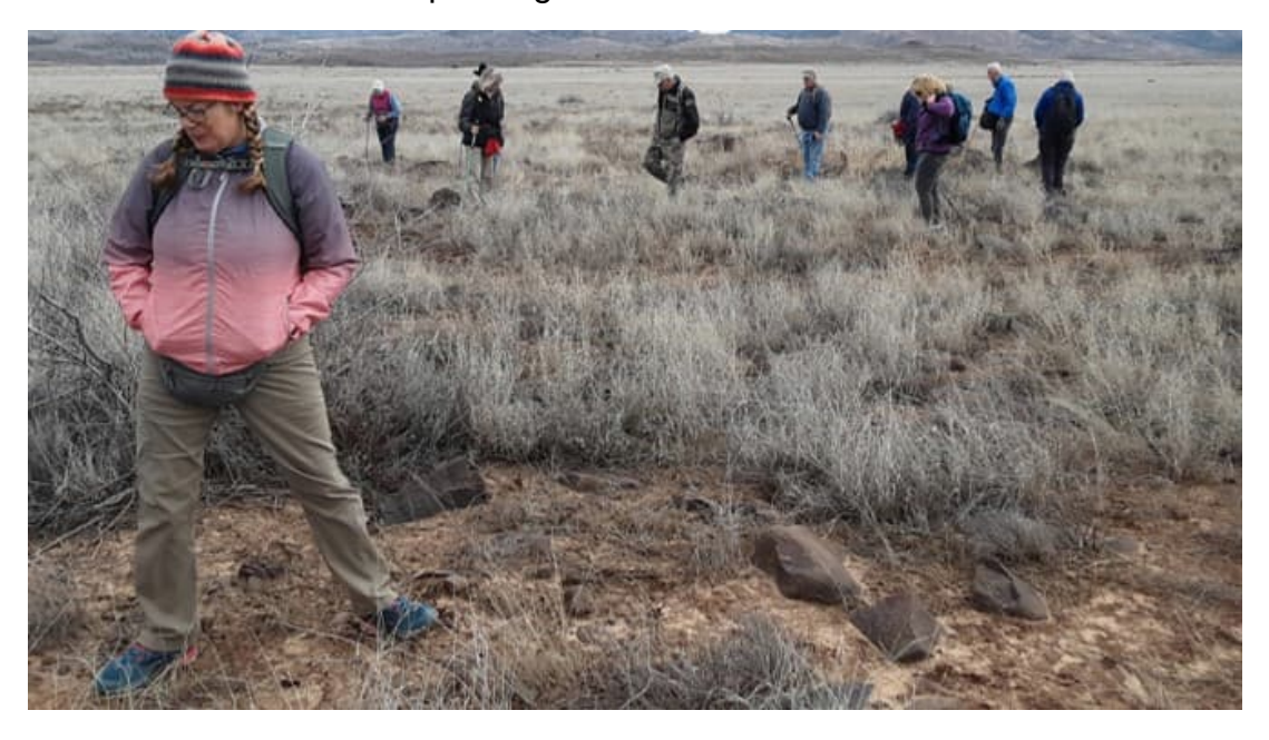
And the Search for Petroglyphs Continued