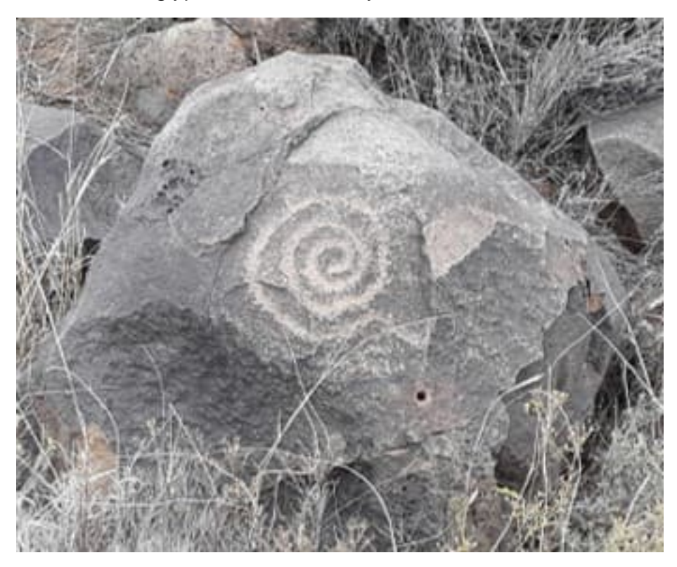
And Spirals ...