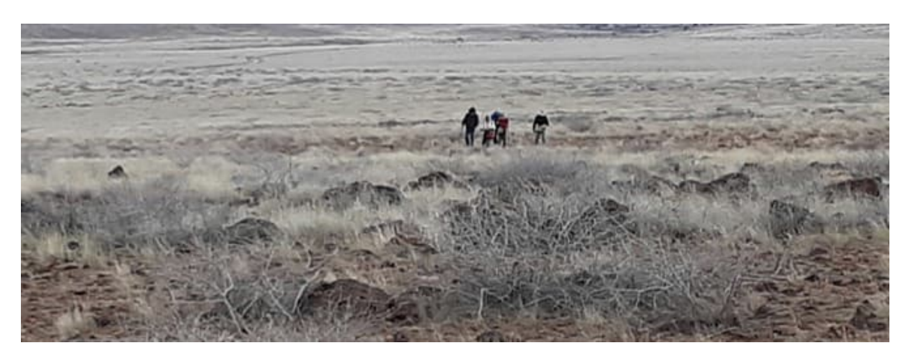
There was a Lot of Space to Search

Some Artifacts were Spotted, Mostly Potsherds.