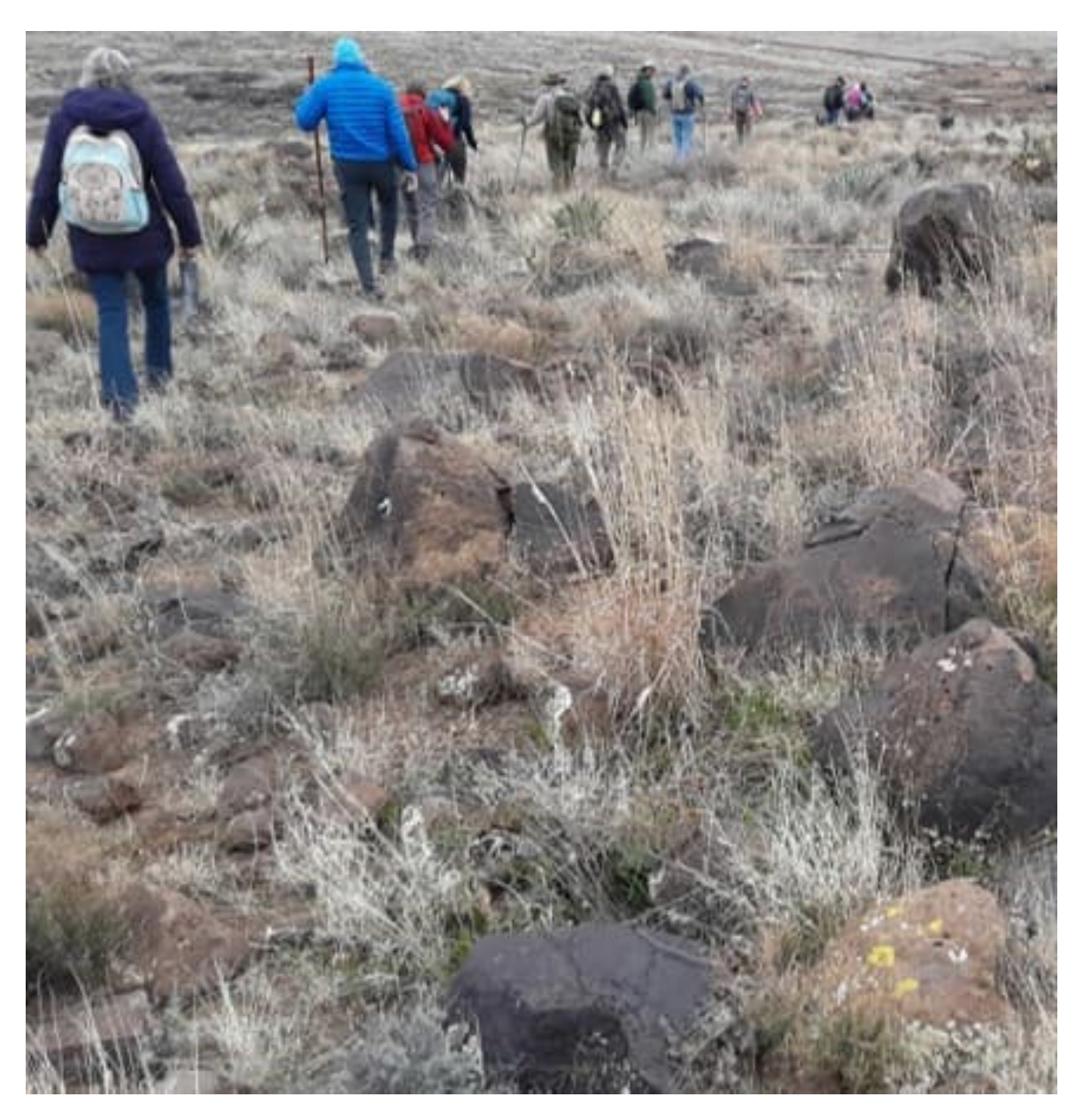
After Several Hours Walking for about Three Miles, with a Break for Lunch, Field Trippers Headed for Home, After Seeing Dozens and Dozens of Beautiful and Intriguing Petroglyphs Placed Here by Prehistoric Americans