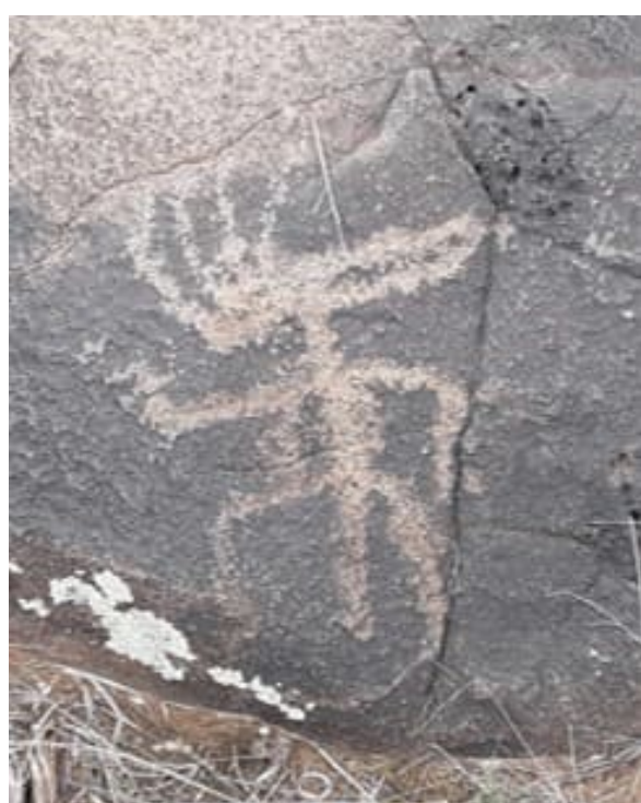
Some Isolated Petroglyphs