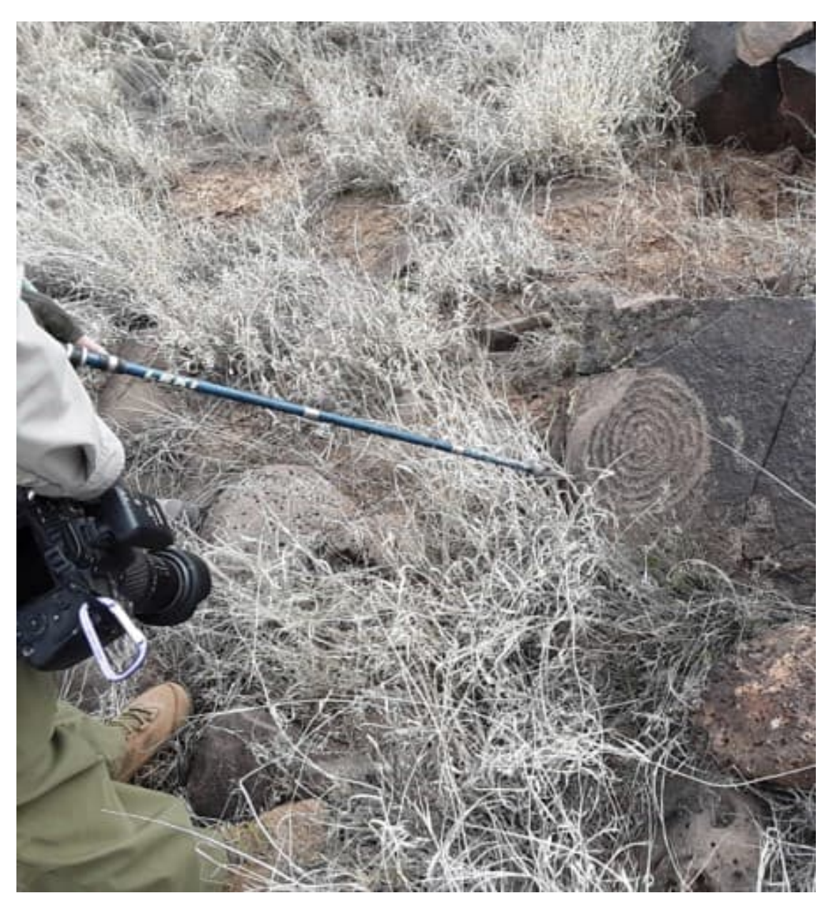
There were a Number of Carefully Made Concentric Circle or Spiral Petroglyphs