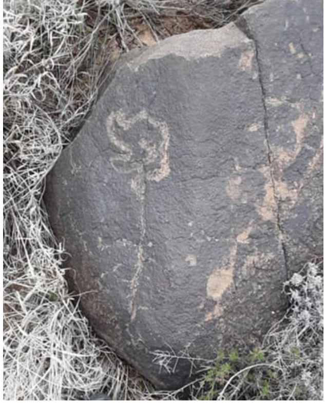
Some Boulders had Single Glyphs on Them