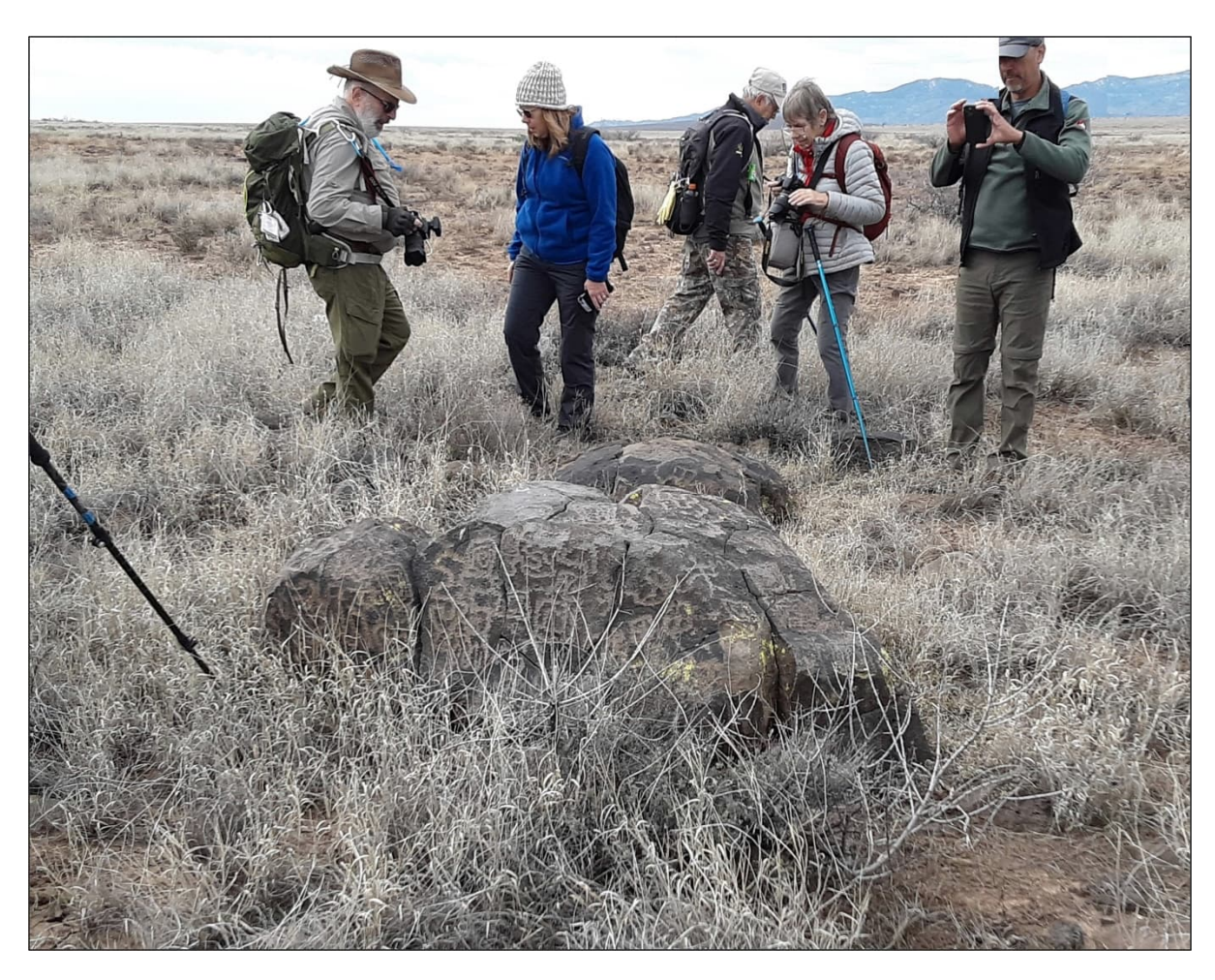
Other Boulders Had Complex Figures