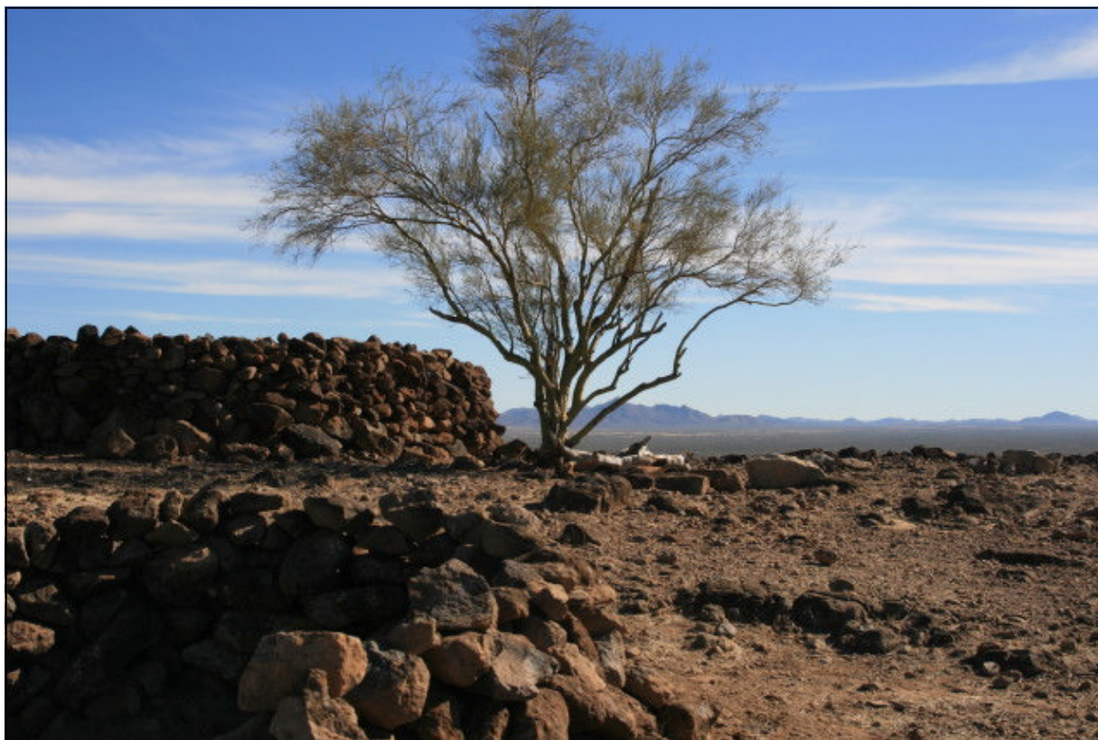
Trincheras Ruin, Mexico