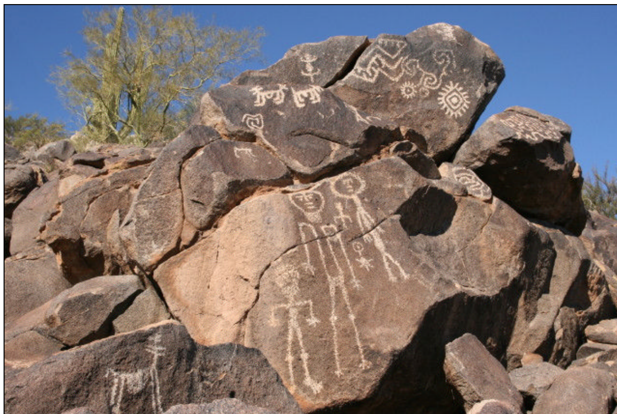
La Provedora Petroglyph Site Sonora, Mexico