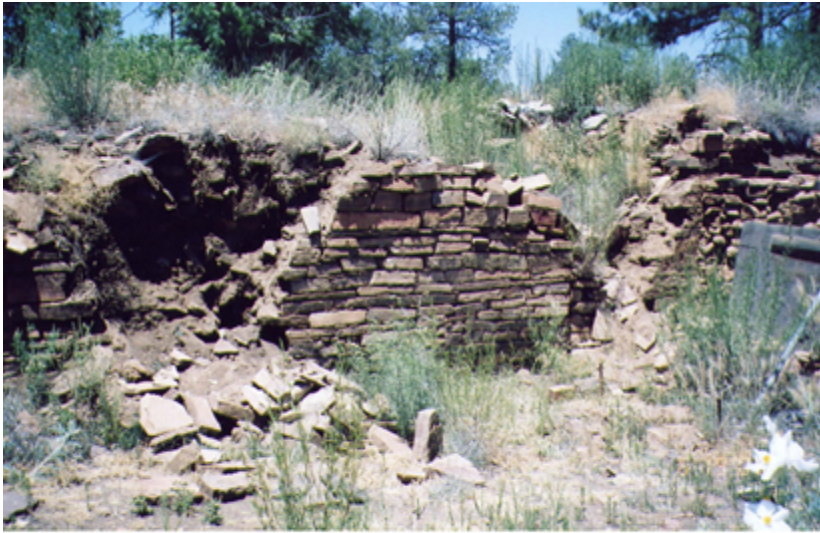
#4 "Damaged wall along west side of Pueblo I plaza. Room 37 damage on the left, Room 38 on the right."