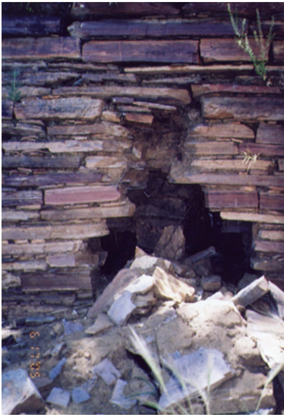
#2 "Vandal damage to the north wall of Room 15.

Sometime during the winter someone had vandalized several walls in Pueblo I. John Hohmann suggested that repairing the vandalized walls had priority over relaying the wall.