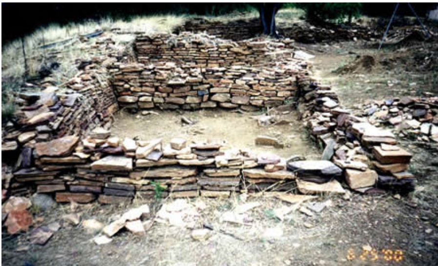
Pueblo I, Rooms 3 and 4 looking North before being stabilized. Photo taken June 2000.

2003 J. Britton supervised the stabilization crew which included: M. Britton (2 days), D. Sorensen (5 days), W. Sorensen (5 days), and G. Kurzhals (3 days). Our first objective was to repoint the west wall of Room 3 and to relay and repoint the east walls of Room 3 and Room 4 in Pueblo I. The east walls of these two rooms were in very bad condition due to being exposed to weather, animals, and differential fill for approximately 12 years. Using enlarged photos as maps, the stones were numbered and marked on the map. The stones were then removed, new amended mortar applied and the stones relayed. Where needed new stones were added to even off a course. SoilShield-LS was used again this year at a ratio of 20 to 1 to make the amended mud.