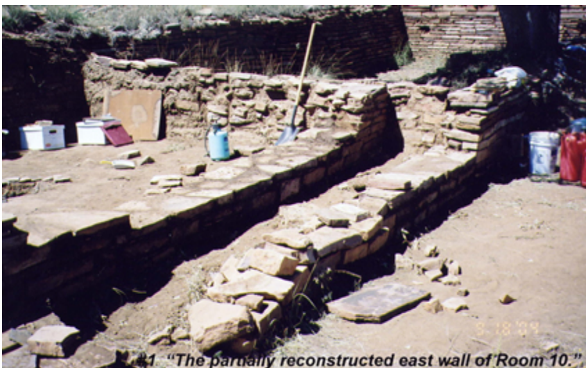
#1 "The partially reconstructed east wall of Room 10."

2004 Stabilization work was scheduled to be done during the September Work Weekend that ran from the 16th to the 20th. Our main objective this field session was to reconstruct and stabilize the east wall of Room 10 (On 1989 site map this room was shown as Rooms 9 and 10). The center portion of the wall had collapsed sometime prior to April 2003. The stones fell to the east and landed in a pile of rubble. Prior to the June 2003 field session, the stones were removed to facilitate a mapping session lead by John Hohmann. Since the stones had been removed there wasn’t anyway to identify them and relay them in their original positions. Therefore, we reconstructed the bottom three courses along the collapsed section and stair-stepped it up to meet the still intact sections next to the north and south walls (See photo #1). J. Britton lead a crew composed of W. Lesko, M. Britton, S. Lesko and D. Bengé.