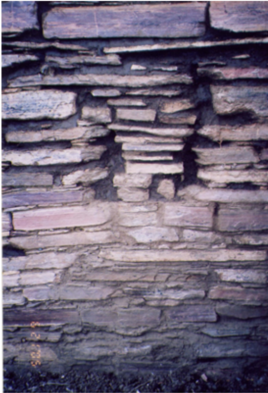
#3 " Relayed wall face of damaged area shown in photo #2."

We used unamended mud to replace the room fill. However, we used SoilShield amended mud to relay the wall stones in there original positions (See photo #3)