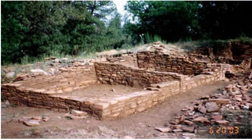
Pueblo I, Rooms 3 and 4 looking North West after stabilization. Photo taken June 2003.

Our second objective was to stabilize the south wall of Room 15. This is a very important wall in tracing the site growth and for interpreting site use. It separates Room 15 from Room 9/10 and forms a blockage of the “entry way” into Room 15 from the plaza. The east portion of this wall was dismantled and relayed using a hand sketch as a map. The remainder of both exposed wall faces was repointed. Once the excavation is complete in Room 9/10, the newly exposed wall face should be repointed.