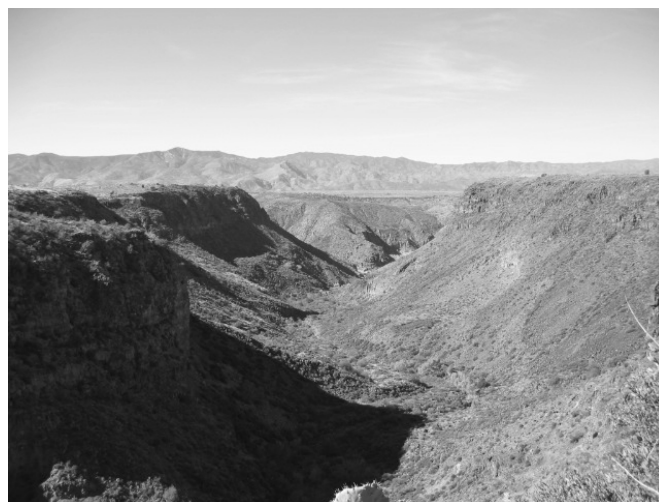
PERRY TANK CANYON

April 7, 8 am-4 pm, Wednesday April 10 & 11, 8 am-4 pm, Saturday and Sunday April 21, 8 am-4 pm, Wednesday